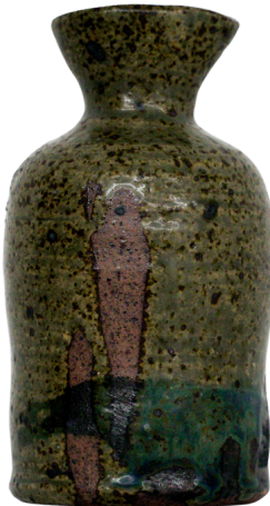
3. Sake Bottle 3 3.25 x 3.25 x 5.5 inches (approx.) Stoneware 2023 Code: TG2023-JP-038 PHP 3,520.00