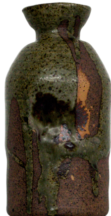
8. Sake Bottle 8 3.25 x 3.25 x 5.5 inches (approx.) Stoneware 2023 Code: TG2023-JP-043 PHP 3,520.00