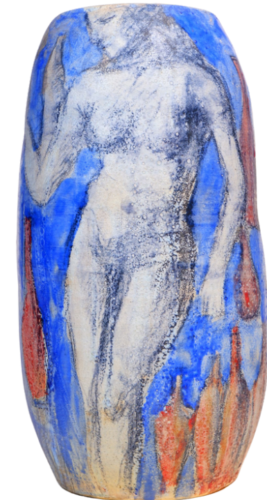
Jar with Figures