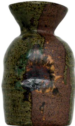
1. Sake Bottle 1 3.25 x 3.25 x 5.5 inches (approx.) Stoneware 2023 Code: TG2023-JP-036 PHP 3,520.00