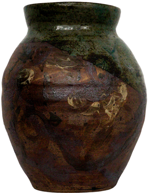
East Asian-Australasian Flywar Jar 1 10 x 10 x 12 inches Stoneware 2023 Code: TG2023-JP-046 PHP 17,600.00