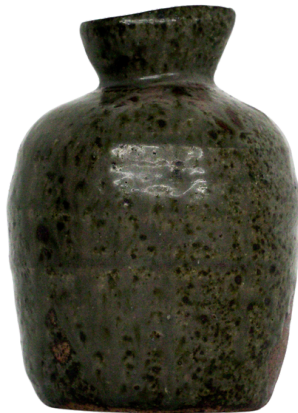
2. Sake Bottle 2 3.25 x 3.25 x 5.5 inches (approx.) Stoneware 2023 Code: TG2023-JP-037 PHP 3,520.00