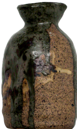
4. Sake Bottle 4 3.25 x 3.25 x 5.5 inches (approx.) Stoneware 2023 Code: TG2023-JP-039 PHP 3,520.00