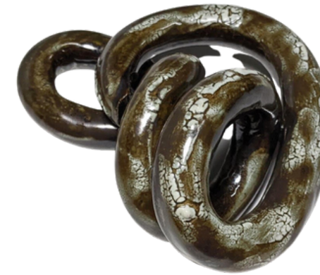
Molting Season (2 of 2)