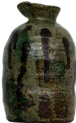
6. Sake Bottle 6 3.25 x 3.25 x 5.5 inches (approx.) Stoneware 2023 Code: TG2023-JC-041 PHP 3,520.00