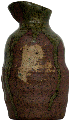
7. Sake Bottle 7 3.25 x 3.25 x 5.5 inches (approx.) Stoneware 2023 Code: TG2023-JP-042 PHP 3,520.00