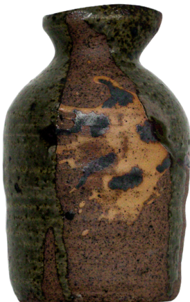
5. Sake Bottle 5 3.25 x 3.25 x 5.5 inches (approx.) Stoneware 2023 Code: TG2023-JC-040 PHP 3,520.00