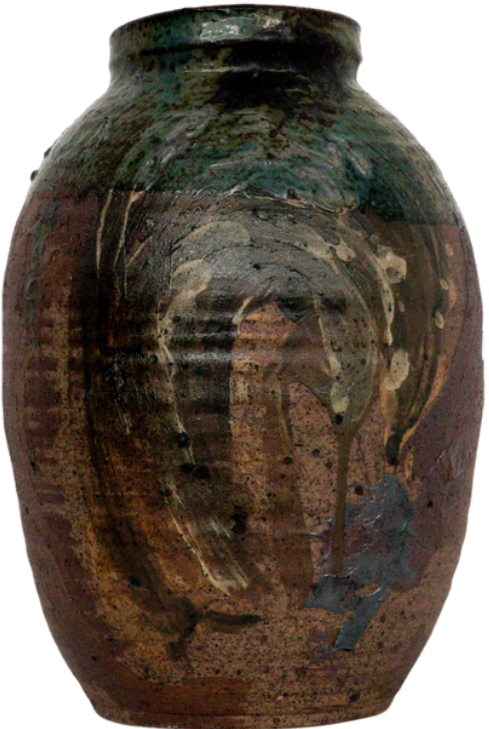
East Asian-Australasian Flywar Jar 2 8 x 8 x 11.5 inches Stoneware 2023 Code: TG2023-JP-047 PHP 17,600.00