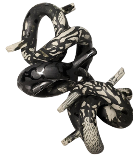
Molting Season (1 of 2)